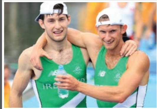
Paul & Gary O'Donovan