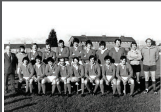
1978 Munster Rugby Team